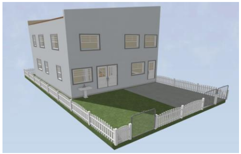
Plans of the new In His Footsteps Building

We are experiencing in Overcome and Vrygrond, as in all other townships, that parents are falling behind with paying school fees — resulting in a drop in income for the ECD Centres and Principals are not able to pay the already extremely low teachers' salaries. Since the beginning of the Covid-19 crisis, Kinderhilfe-Kapstadt and the Wood Student Foundation have jointly paid between 40% and 60% of the wage costs of the following ECD Centres: