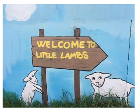
Colourful murals at Little Lambs .....are enjoyed by children and parents alike

The enrolment of children was completed beginning of February and lessons then started as scheduled. The Covid-19 compliances still take up a lot of time in the morning and during the day – but they have proven to be effective and we are happy to report that not a single Covid-19 incident has been recorded since the reopening of our EDC in September 2020. However, due to Covid-19, the number of children registered has fallen from 300 to 260 children. This, of course, leads to a