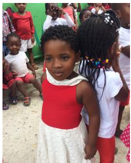
We are happy to welcome all children back to the various ECD Centres

Without your valued support, it would be extremely difficult for SEEDS / Kinderhilfe-Kapstadt to assist these projects.